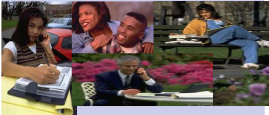
Libraries serve today's mobile society well

Ada Community Library 10664 W. Victory Rd. Boise, ID 83709 Ph. 208-362-0181 F. 208-362-0303 www.adalib.org