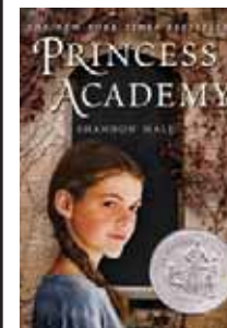
Princess Academy by Shannon Hale

This isn't your typical fairytale. The wise men of the kingdom have declared that the next princess will come from Miri's remote mountain village. The girls of the village are sent to the princess academy to learn how to be a princess. The story explores and develops Miri's relationships with her family and how she discovers her strengths and achieves her own happy-ever-after.