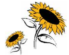
Diamond Willow by Helen Frost

A new spin on the classic tale with great illustrations. Will the wolf get the sheep? What can Betsy do to protect them?