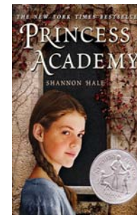
Princess Academy by Shannon Hale

This isn't your typical fairytale. The wise men of the kingdom have declared that the next princess will come from Miri's remote mountain village. The girls of the village are sent to the princess academy to learn how to be a princess. The story explores and develops Miri's relationships with her family and how she discovers her strengths and achieves her own happily-ever-after.