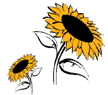
Diamond Willow by Helen Frost

A new spin on the classic tale with great illustrations. Will the wolf get the sheep? What can Betsy do to protect them?