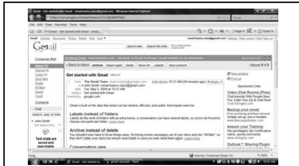
Reading Your Email